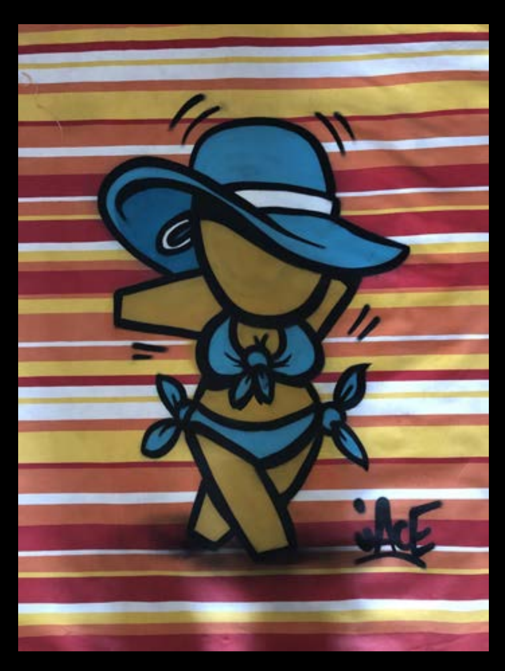
4-JACE 90x120- UNTITLED AÉROSOL ON FABRICS