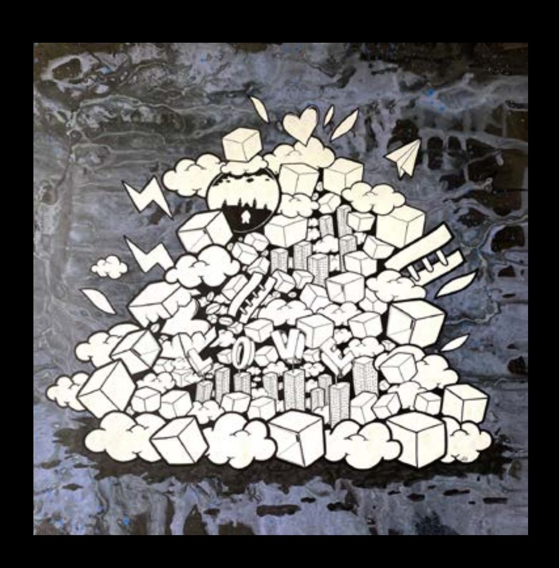
15-VAST 90X90- LOVE IN ATLANTIS ACRYLIC ON CANVAS