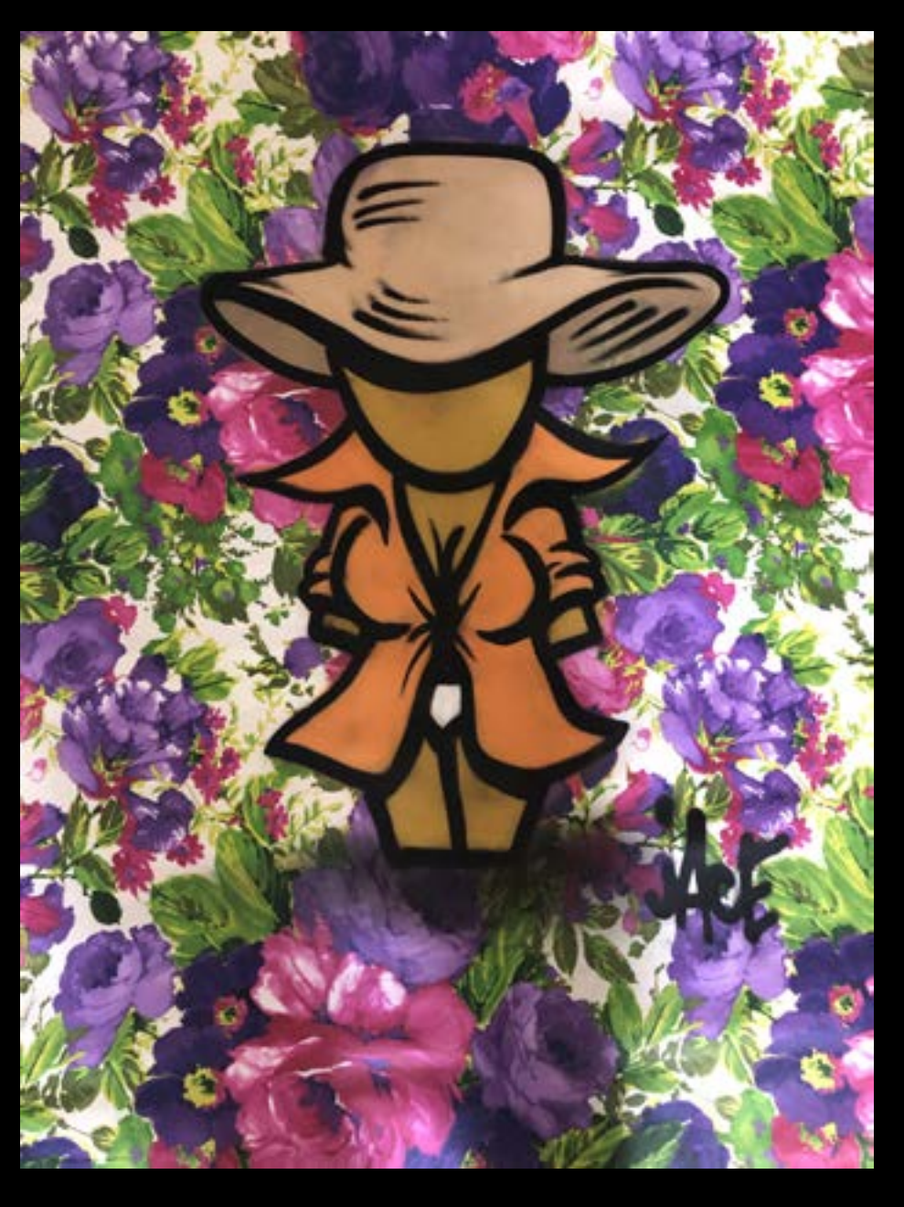
3-JACE 90x120- UNTITLED AÉROSOL ON FABRICS