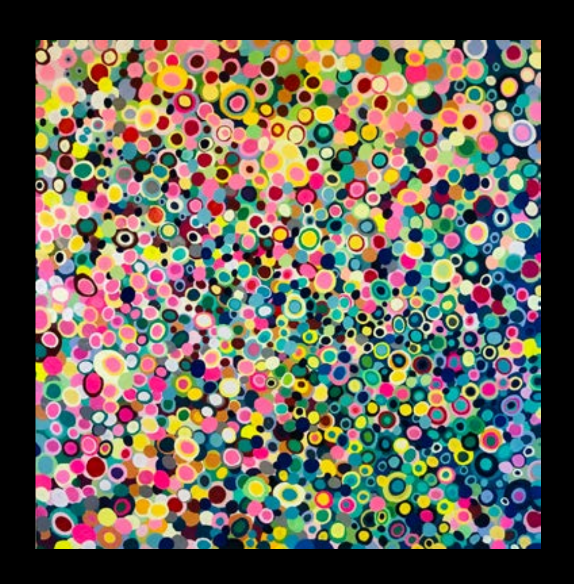
9-LIONEL LAURET 100X100- CAPTIVATING ENERGY ACRYLIC ON CANVAS