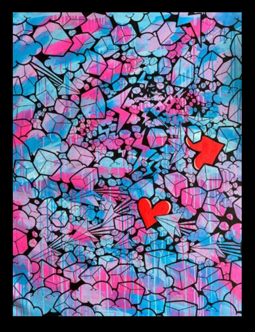
13-VAST 95X125- LOVE IN RAINY DAYS ACRYLIC ON CANVAS