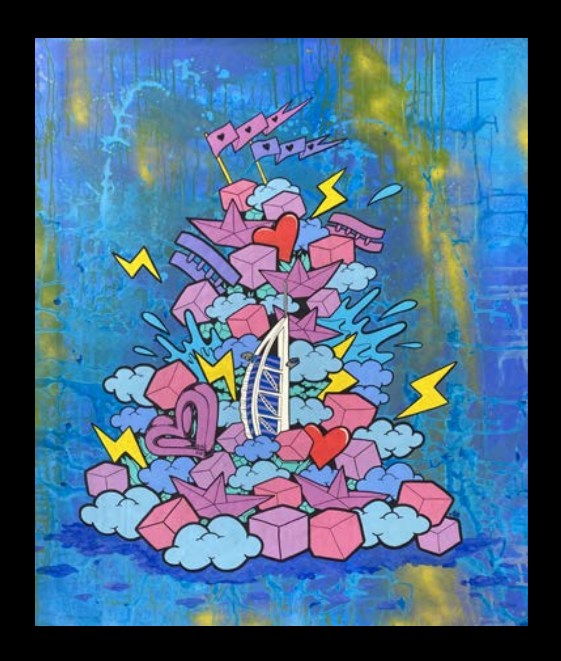
16-VAST 90X110- LOVE IN BURJ AL ARAB ACRYLIC ON CANVAS