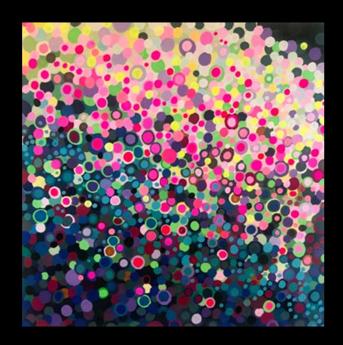
7-LIONEL LAURET 100X100- COSMIC DISPLAY ACRYLIC ON CANVAS