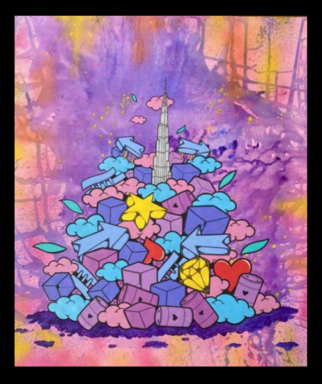
17-VAST 90X110- LOVE IN BURJ KHALIFA ACRYLIC ON CANVAS