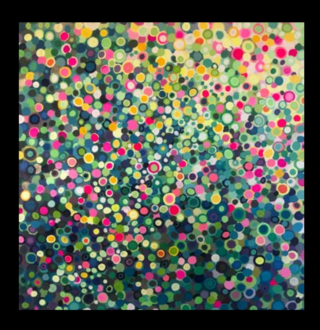
8-LIONEL LAURET 100X100- ELECTRIC SYMPHONY ACRYLIC ON CANVAS